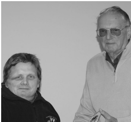
Lancashire County Airgun Champions for 2007.